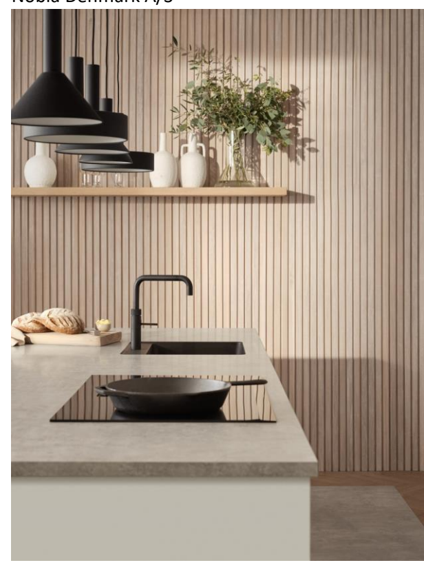
EPD HUB, HUB-0689

Laminate worktop 30 mm Nobia Denmark A/S